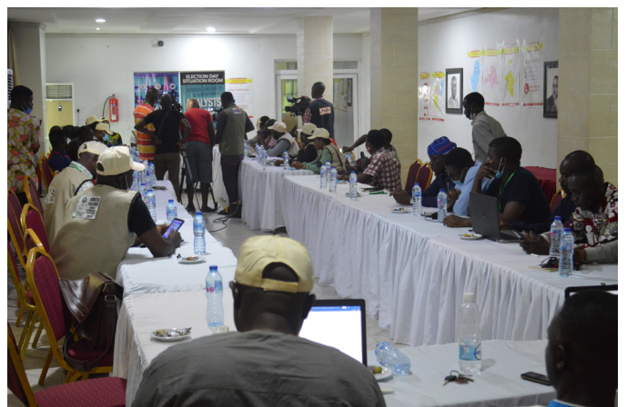
Situation Room Election Day Setup