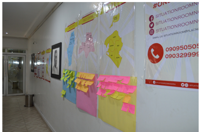
Situation Room Election Day Field Observation