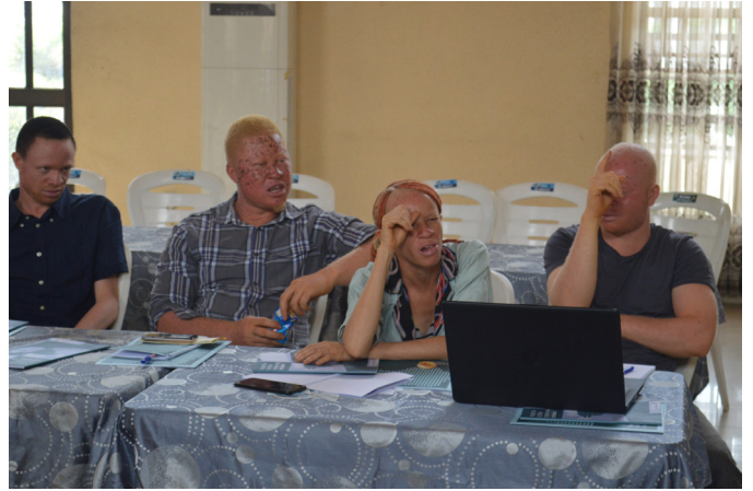
Situation Room Training of Election Observers