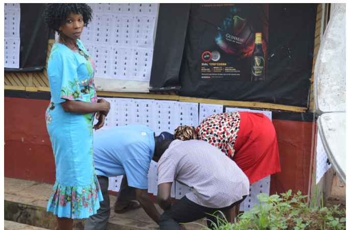
Situation Room Election Day Field Observation