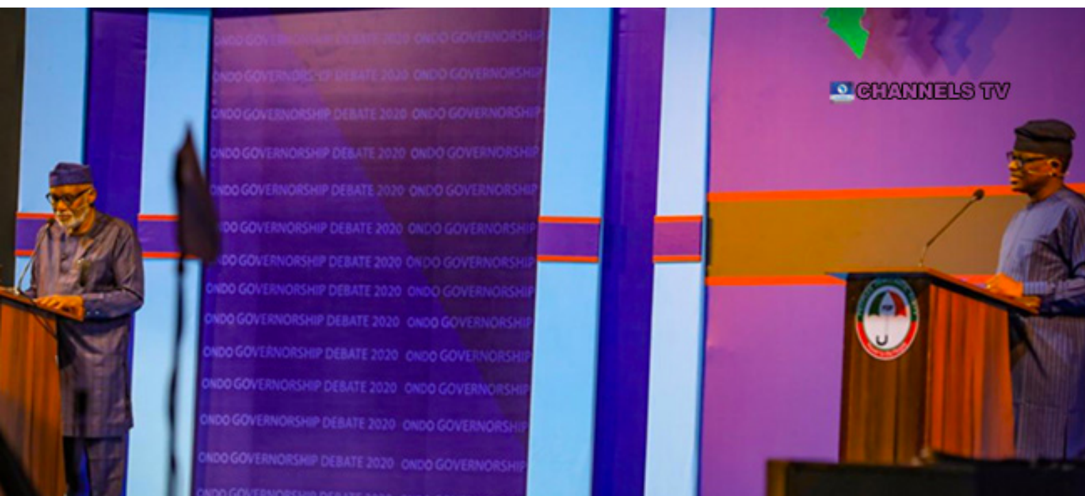
Ondo State Governorship Election Candidates at the Governorship debate.

A governorship debate held on Wednesday, 7th October 2020, a few days to the election. The debate was organised with support from Situation Room. Although the candidates of the three main political parties in the Ondo State governorship election, Rotimi Akeredolu of the APC, Eytayo Jegede of the PDP and Agboola Ajayi of the Zenith Labour Party (ZLP) were billed to participate in the debate, only the candidates of the APC and PDP showed up for the event. Both candidates spoke on a series of topics, ranging from taxation and revenue, the State civil service, education, to power and healthcare, providing the electorate with their perspectives on several of these issues. The platform provided an opportunity for issue based campaign, which was largely absent in the lead up to the election.