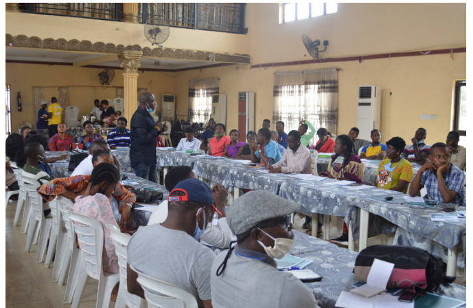
Situation Room Training of Election Observers