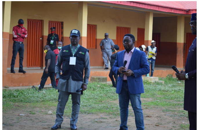
Situation Room Election Day Field Observation